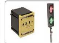
Loop Detector (Double)