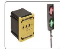
Loop Detector (Double)