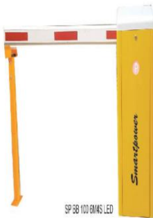
SP BB 100 6MS LED