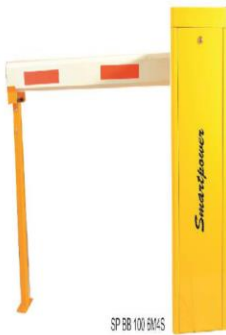
SP BB 100 6MS

For Residential & Commercial purpose SP BB 100 (6 Meter 4 Sec)